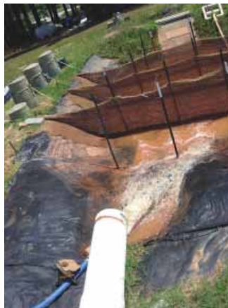
Figure 1. Photo of stilling basin beginning to fill.

Bhardwaj, A. K., R. A. McLaughlin, and D. L. Babcock. 2008. Energy dissipation and chemical treatment to improve stilling basin performance. Transactions of the ASABE. 51(5): 1645-1652.