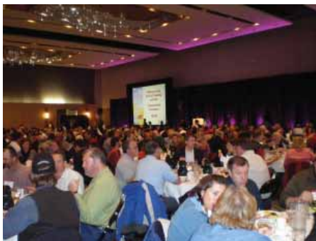
Figure 3: Attendees enjoying a well deserved break from class during Monday's luncheon.

Monday evening was set aside for IECA Chapter meetings. The Southeast Chapter had a remarkable turnout with over 40 people in attendance to mingle and introduce ourselves, again learning about other practices and ideas.