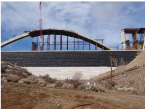
Figure 1. View of an overpass constructed along the I-580 freeway.

This project, when finished, will be the connector between Carson City and Reno and will consist of 7.4 miles of 6-lane freeway including 7 bridges. Some of the techniques used to control erosion and establish vegetation on 1.5:1 slopes that primarily consisted of rock were quite amazing. They were able to establish some vegetation with a combination of top soil, rock and organic matter, soil inoculants and hydroseeding with two different application rates of paper mulch with tackifier (and some pretty rare spring storms).