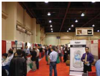
Figure 4: Grand opening of EC09 expo hall.

Tuesday February 10th, Wednesday February 11th, and Thursday February 12th were designated days for technical sessions with breaks to enjoy awards luncheons and time in the expo hall where vendors from all over the world were there displaying their products.