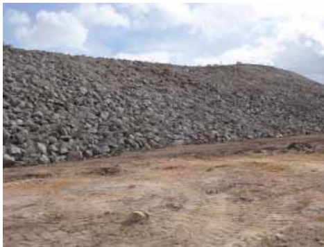
Figure 2. Re-vegetation and stabilization of slope along the I-580 freeway.

Monday evening was set aside for IECA Chapter meetings. The Southeast Chapter had a remarkable turnout with over 40 people in attendance to mingle and introduce ourselves, again learning about other practices and ideas.